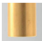
OT Natural brass

Considering the craftsmanlike manufacturing of the product and the special finishing process, always by hand, you may find different appearances and shades between one product and another and they are to consider as absolute distinction of the item.