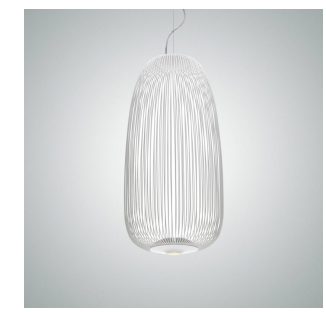
Spokes 2 Large