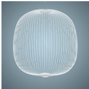
Spokes 2 Large