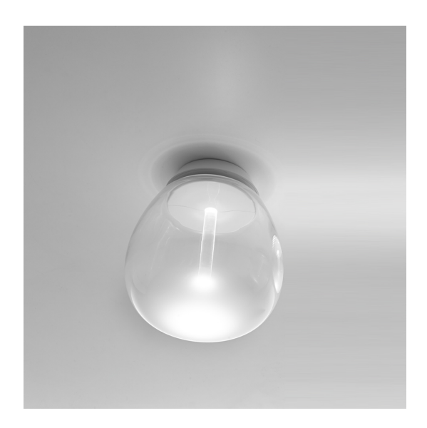
IP20 (♣) (IIII ( € Dimmerable: + 0 -