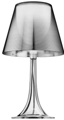
Table lamp providing diffused light. Fully transparent, injection-molded PMMA polymethylmethacrylate frame; opaline, injection-molded polycarbonate internal diffuser and injectionmolded transparent or colored polycarbonate external diffuser completely finished with high-vacuum aluminization process.